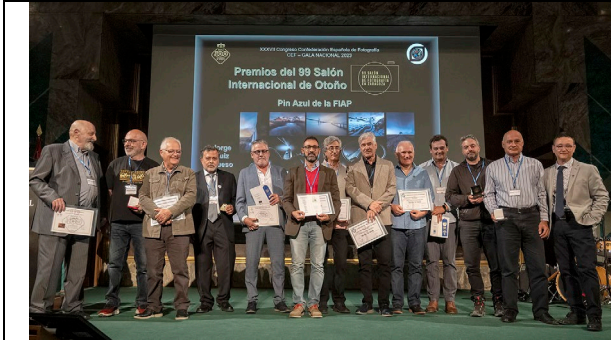
Ceremonia de entrega de Premios / Awards ceremony

PHOTOGRAPHIC EXHIBITION THE CENTENARY FROM 2023