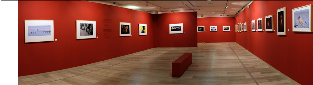
Exhibition dedicated CEF Gold medals and CEF Honorable Mention of the Salon