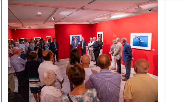
Inauguración de la exposición / Exhibition openig