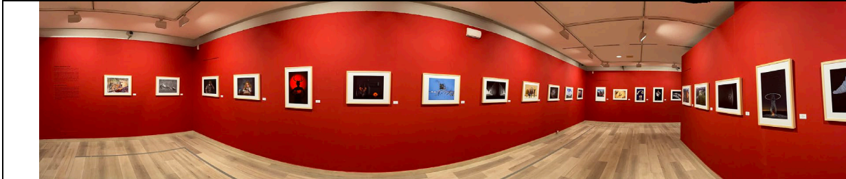
Exhibition dedicated to the best author of the Salon (FIAP Silver Medals and FIAP Honorable Mention)