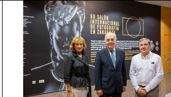
Cartel anunciador y autoridades Ibercaja / Exhibición poster